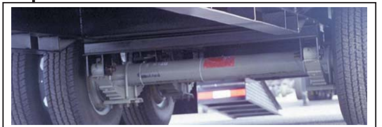
Dexter axles with 3" heavy duty rubber bushed suspension