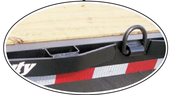
Combination Stake Pockets & D-Rings (optional)