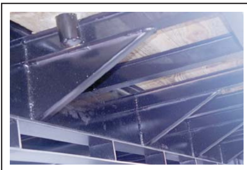
3" Mini I-beam crossmember 3/16" solid gusset with 1" bend