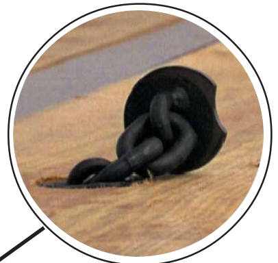
Flatbed Tie down (optional)