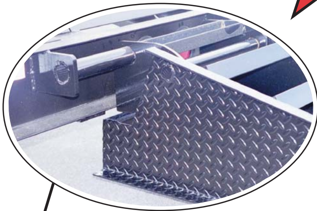
Intergrated Ramp Support